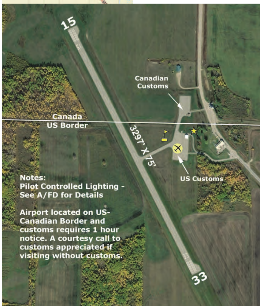
Piney-Pinecreek Border Airport